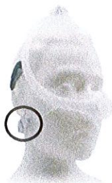
Figure 2: DreamWisp Nasal Mask