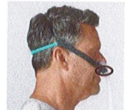
Figure 5: Therapy Mask 3100 NC/SP