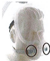
Figure 3: DreamWear Full Face Mask