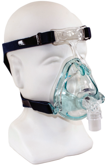
Sapphire Full Face Mask