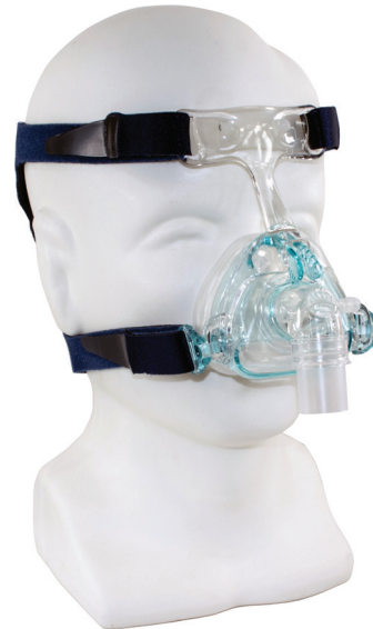
Sapphire Nasal Mask